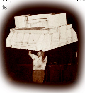
Lost Foam Pattern, 1950s

1956 —First Betatron is installed in U.S. foundry at ESCO Corp., Portland, OR,