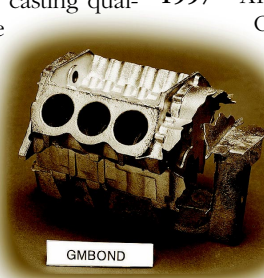
GMBond-produced engine block, 1996

Late 1990s-Stress and distortion simulation introduces the benefits of controlling casting distortion, reducing residual stresses, eliminating hot tears and cracking, minimizing mold distortion and increasing mold life.