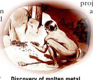
Discovery of molten metal (copper beads in fire)

1646—America's first iron foundry (and second industrial plant), Saugus Iron Works, near Boston, pours the first American casting, the Saugus pot. The Saugus River site was selected by